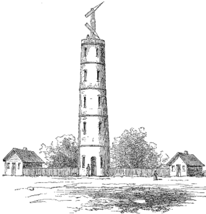
Russian Telegraph Station, 1858.